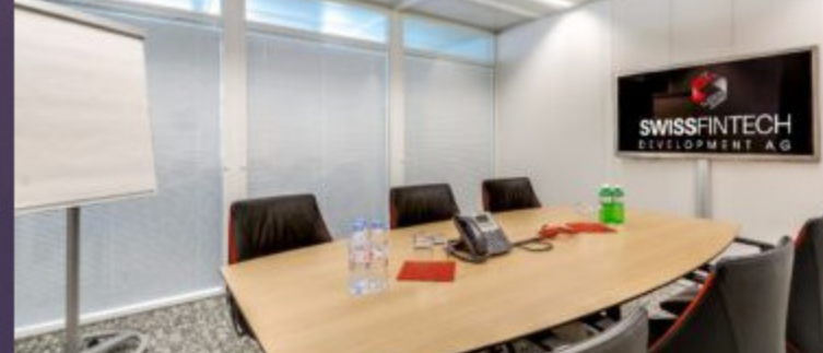
Always there for you We love to welcome you