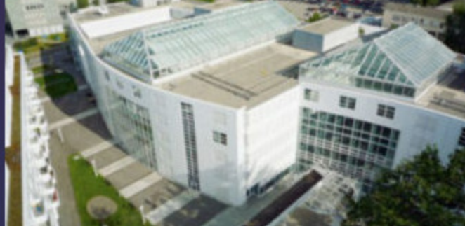
Our Office Being in best companion